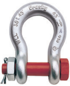
G-2140 / S-2140

G-2140 meets the performance requirements of Federal Specification RR-C-271F, Type IVA, Grade B, Class 3, except for those provisions required of the contractor. For additional information, see page 452.