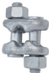
G-429 Fist Grip® Clip 3/16" - 5/8"

Fist Grip® wire clips meet or exceed the performance requirements of Federal Specification FF-C-450E Type III, Class 1, except for those provisions required of the contractor. For additional information, see page 452.