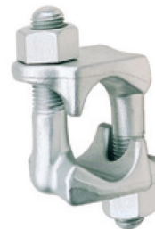
G-429 Fist Grip® Clip 3/4" - 1-1/2"