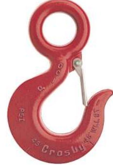
L-320C Frame Size O-T