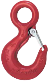
L-320CN Frame Size D-N