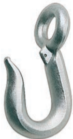
1210 Round REVERSE EYE HOOK