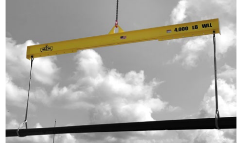
LIFTING BEAM - LOW HEADROOM ADJUSTABLE