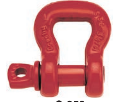
S-253 SCREW PIN SLING SHACKLE