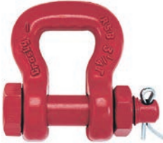
S-252 BOLT TYPE SLING SHACKLE