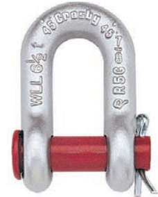
G-215/S-215 G-215 Round pin chain shackles meet the performance requirements of Federal Specification RR-C-271F Type IVB, Grade A, Class 1, except for those provisions required of the contractor. For additional information, see page 476.