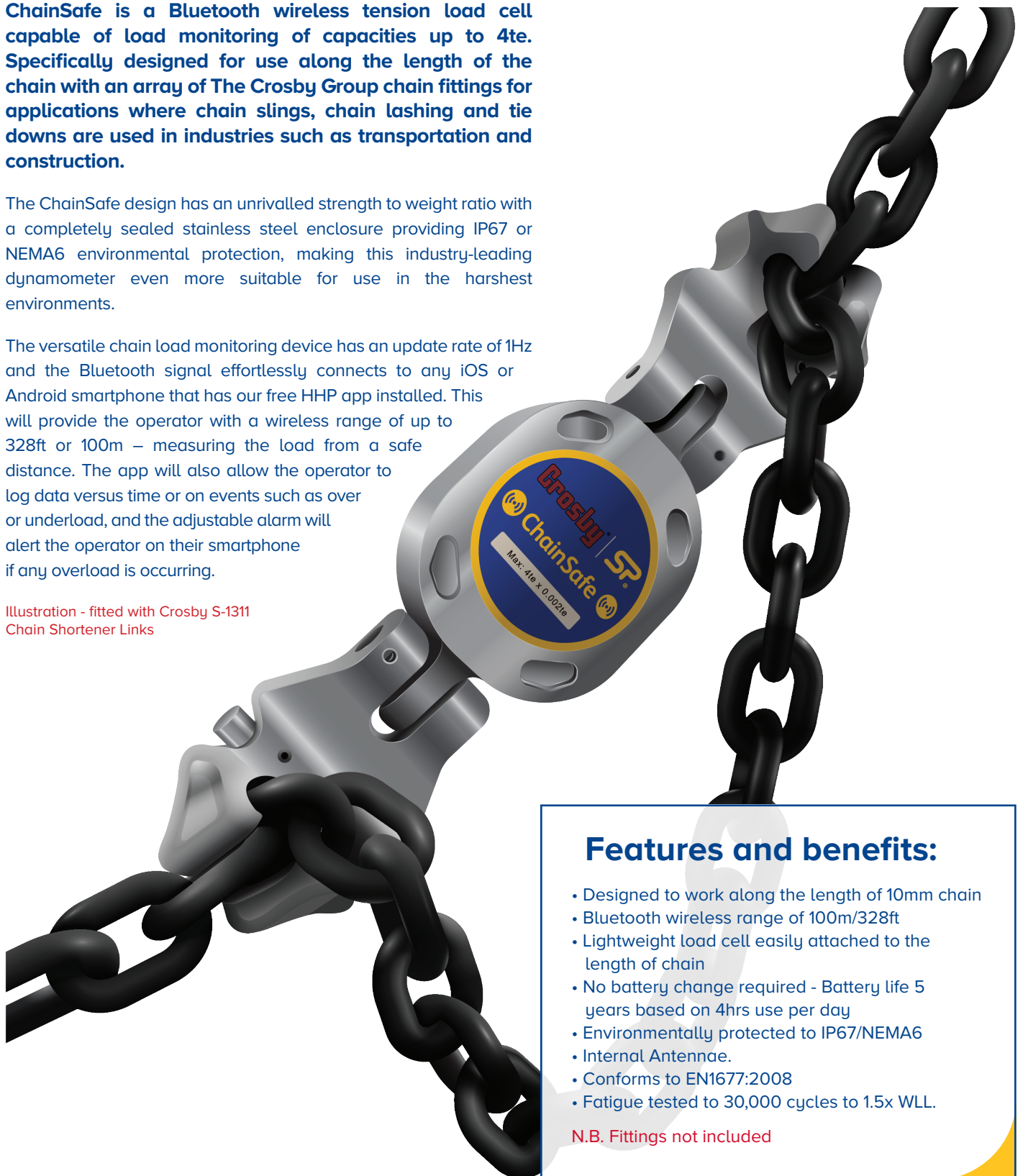
Illustration - fitted with Crosby S-1311 Chain Shortener Links

The versatile chain load monitoring device has an update rate of 1Hz and the Bluetooth signal effortlessly connects to any iOS or Android smartphone that has our free HHP app installed. This will provide the operator with a wireless range of up to 328ft or 100m – measuring the load from a safe distance. The app will also allow the operator to log data versus time or on events such as over or underload, and the adjustable alarm will alert the operator on their smartphone if any overload is occurring.